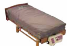
Code: HKNEMW True low air loss wondermat mattress system (25st/160kg).