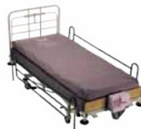
Code: HKNEMS Supreme mattress (high risk overlay) (24st/152kg).