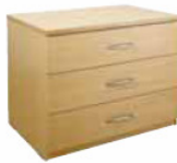
Code: FUSM3DT (Silver Medal) Medal three drawer chest

Cabinet comes with a lockable top drawer.