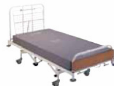
Code: HKNEMR Replacement mattress (medium risk)

Supplied with a two-way stretch vapour permeable waterproof cover (15st/108kg).