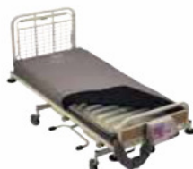
Code: HKNEMO Opal mattress (medium risk overlay) (16st/110kg).