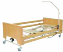
Code: HKNEBT01 Trend bed

"All of our profiling beds are electrically operated to minimise the risk of injury to staff and to make their work more pleasurable: happy staff create a happy environment for your residents."