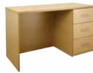
Code: FUSMDT (Silver Medal) Medal dressing table