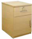
Code: FUSMBC01 (Silver Medal) Medal bedside cabinet

Manufactured at our own site, our sturdy 'Medal' bedroom furniture range is designed specifically to meet the needs of your market - built and tested to FIRA and British Standards BS4875 for strength and stability and guaranteed for five years. Stylish, simple and practical, with an emphasis on both quality and hygiene, all items are available in a choice of eight finishes with a smooth, plain door style (Silver Medal range) or a panel-detail door (Gold Medal range) which comes in our Beech finish. We can also produce to your own designs and specifications.