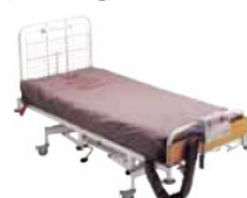
Code: HKNEMC Cavalier mattress (high - very high risk replacement) (30st/189kg).