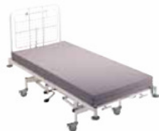
Code: HKNEMC Foam community mattress

"Let us know your resident's Waterlow score so we can ensure you specify the right product to suit their needs."