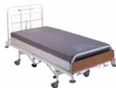
Code: HKNEMFO Foam overlay mattress (low risk)

supplied with a two-way stretch vapour permeable waterproof cover (18st/114kg).