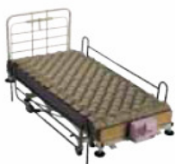
Code: HKNEMBM Bubble mattress (low risk overlay) (12st/76kg).

Supplied with a waterproof cover which is machine washable at 90 degrees and dryer safe (18st/114kg overlay 25st/159kg replacement).