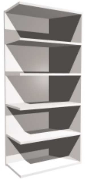
Starter Bay Open