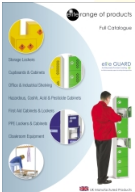
Full Product Catalogue

For information or a brochure on additional products ... ... please contact your local Authorised Distributor